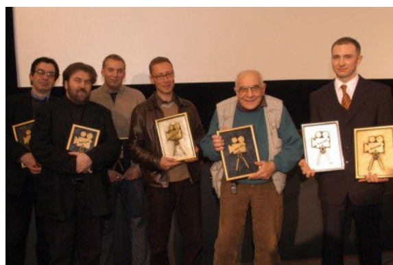
The first DAVID CAMERA AWARDS at the 1st WJFF 2003