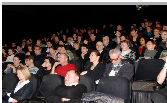
opening of 8th wjff 2010

The Polish premiere of Oscar Nominated AJAMI at the